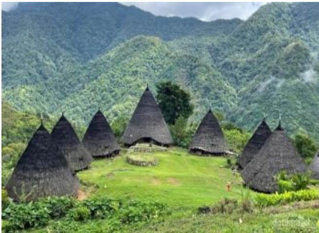
Figure 5. Wae Rebo Village

Meanwhile, mutual understanding in ecotourism management can also be observed in Waerebo Village located in eastern Indonesia. Waerebo Village is a traditional village in Manggarai Regency, East Nusa Tenggara. Waerebo is one of the cultural tourism destinations in Manggarai Regency, situated at an altitude of 1,200 meters above sea level. In this village, there are only 7 main houses called Mbaru Niang. Waerebo Village was declared a UNESCO World Cultural Heritage Site in August 2012, surpassing 42 other countries.