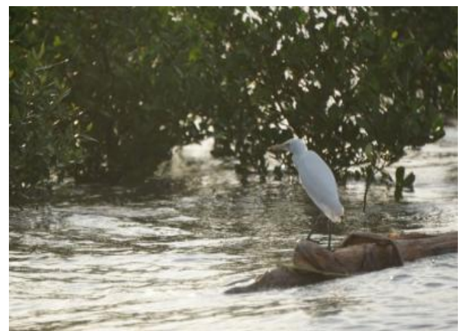
Figure 2. Water Birds in Blekok Village Ecotourism

Examining mutual understanding in community-based ecotourism management is an intriguing aspect. Mutual understanding plays a crucial role in ecotourism management, which can be in the form of shared visions or goals desired by stakeholders in ecotourism management.