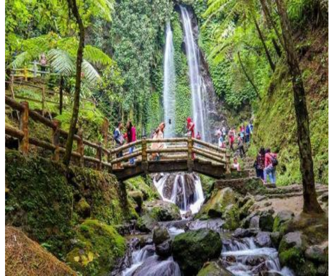
Figure 4. Jumog Waterfall, Berjo Village

located in Karanganyar Regency, precisely on the slopes of Mount Lawu. Located at an altitude of +1,500 meters above sea level, Berjo Village is known as a tourist destination in Karanganyar Regency. Some attractions in this village include Sுகuh Temple, Jumog Waterfall, and Madirda Lake.