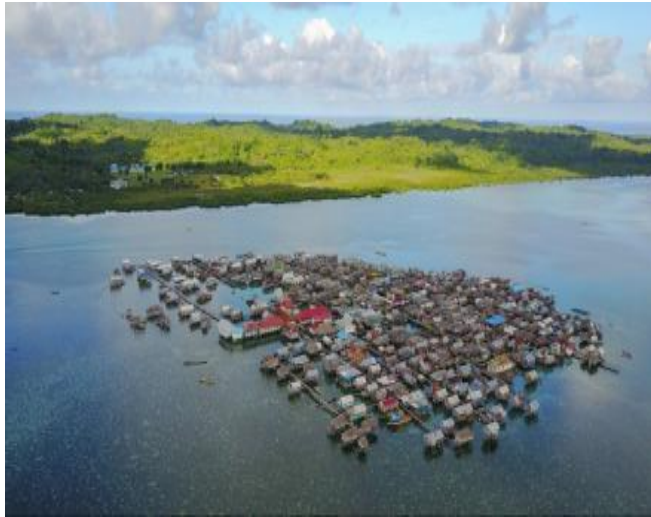
Figure 3. Bajo Mola Village, Wakatobi

collaboration between the government and the community, aims to ensure the preservation of mangrove forests and their biodiversity, making them a superior attraction for Blekok Village Tourism. Ecotourism in Blekok Village also aims to educate all stakeholders about the values of sustainability and the importance of nature conservation (Ramadesta et al., 2022).