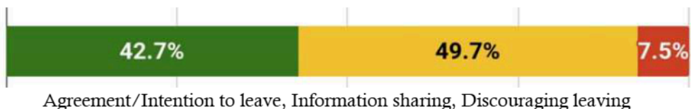
Figure 3. Categorization of Discussion Topics Source: prepared by the author

Although the number of groups sharing information about kaburajadulu is not equal to 50%, this group has the ability to open, deepen, and enlarge the space for the propagation of community unrest. As a result, netizens' desire to escape will grow. There is an attempt to encourage the group sentiment to vote "just run away." Meanwhile, counter groups that encourage people not to run away are considered to be less capable of balancing the dominating flow of conversation.