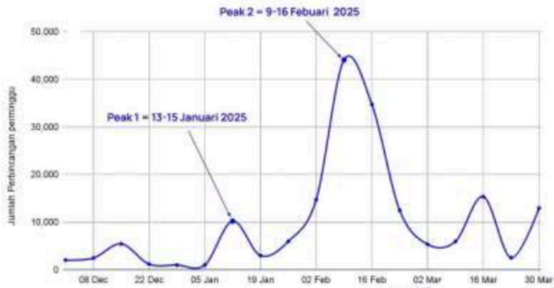
Figure 2. Two peak periods

Based on the data gathered from X, it is clear that there are fluctuations in the debate concerning the phenomenon of the hashtag kaburajadulu throughout the research period. As seen in the graphic below, throughout the research period, two peak periods were observed: Peak 1 on January 13-15, 2025 and Peak 2 on February 9-16, 2025.