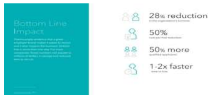
Figure 2 LinkedIn's Survey on Employer Branding

Employer branding can streamline the prolonged recruitment process. A survey by LinkedIn in 2011 found that companies using branding strategies to aid in the recruitment process could hire one to two times faster than before. The survey also discovered a 50% increase in qualified candidates applying within their respective fields. This reduction in administrative work and increased chances of finding the right candidates make the hiring process smoother and more efficient.